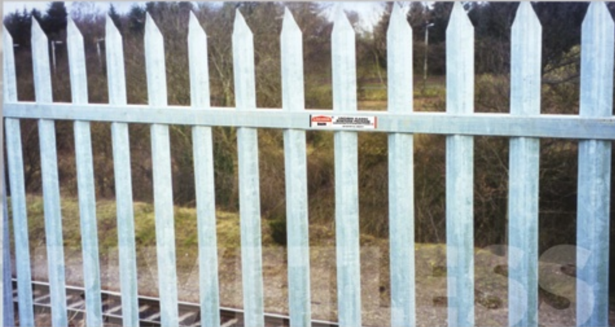
The Lochrin® Bain Classic Rivetless Palisade

The standard Rivetless panel is suitable to take up a 1:8 gradient with more adverse ground conditions being accommodated using bespoke panels.